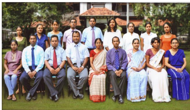
Photos 03: Scene from Certificate Course in Basic Biostatistics and Epidemiology

The Certificate Course in Basic Biostatistics and Epidemiology was initiated by the Department of Community Medicine in 2010. Objective of the certificate course is to develop knowledge and skill needed to plan and implement research. The course consisted of basic Biostatistics module and basic Epidemiology module and was conducted as a weekend course over a period of 11 weeks. The evaluation was based a written examination. The first batch of students consisting of 20 participants from varied fields of medicine and allied health sciences followed the course from 08.05.2010 to 01.08.2010 (Photo 03)